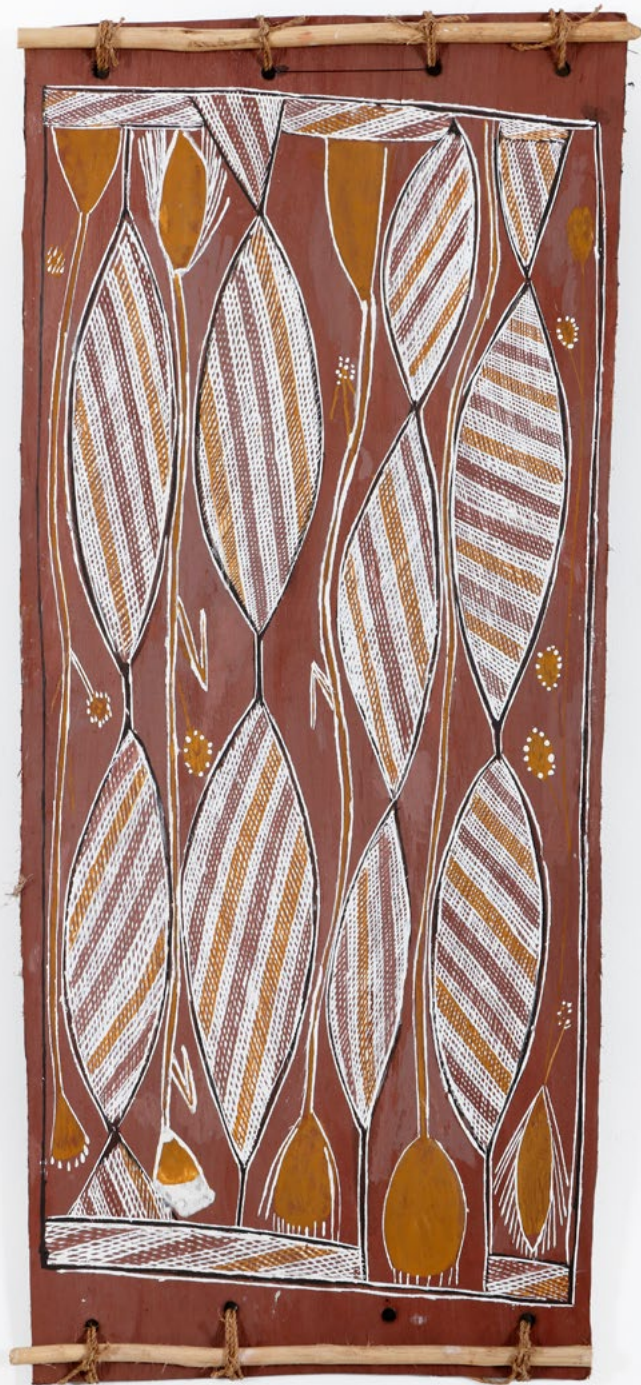
JACK YURRULBBIRRI NAWILIL Mannarlinj (bush potato) 2022 Stringybark with ochre and PVA fixative 84 x 37 cm 494-22