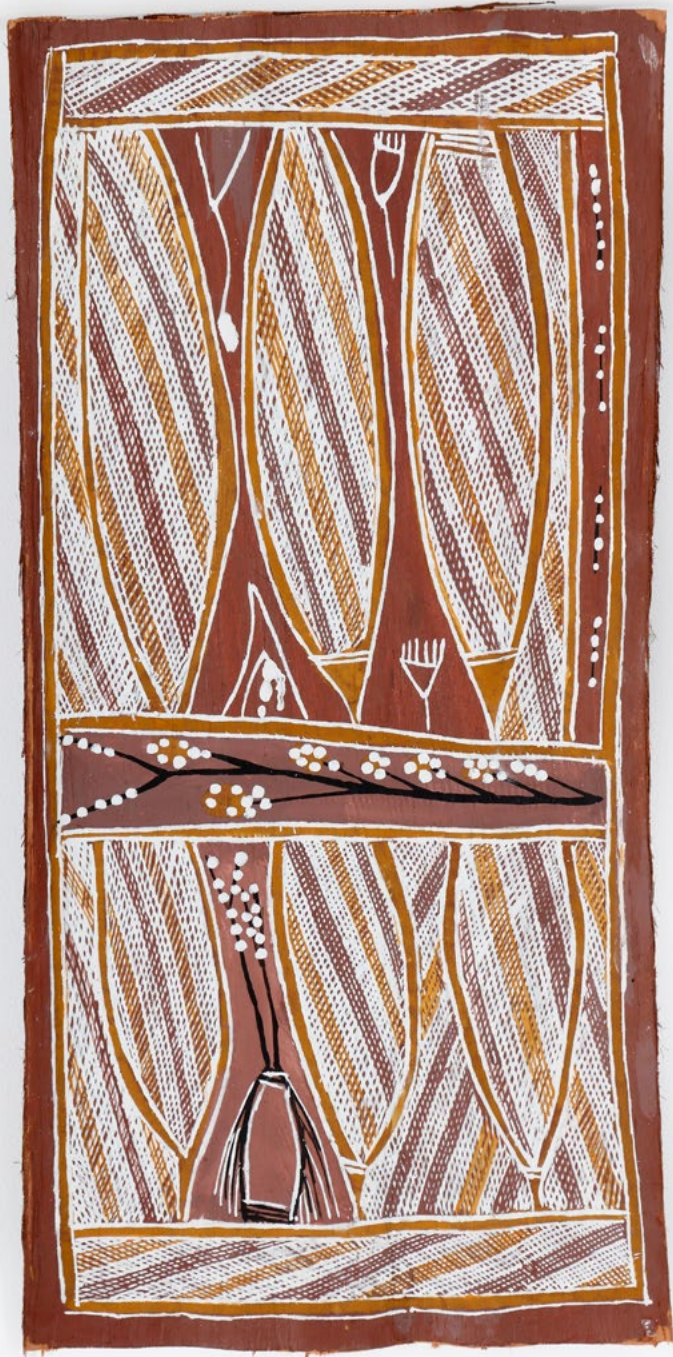
JACK YURRULBBIRRI NAWILIL Mannarlinj (bush potato) 2022 Stringybark with ochre and PVA fixative 74 x 37 cm 252-22