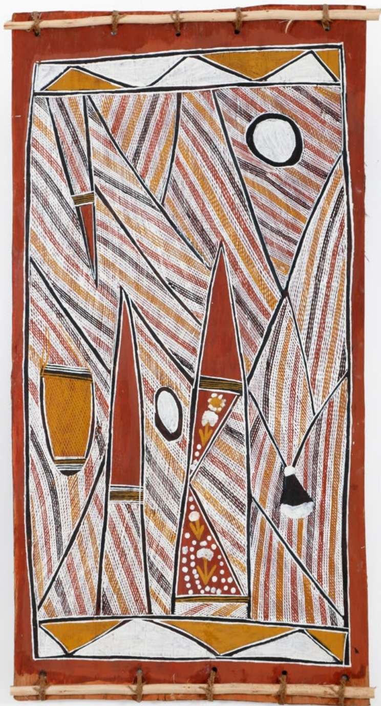
JACK YURRULBBIRRI NAWILIL Kulkaninj (Digging Stick) 2023 Stringybark with ochre and PVA fixative 104 x 53 cm 1127-23