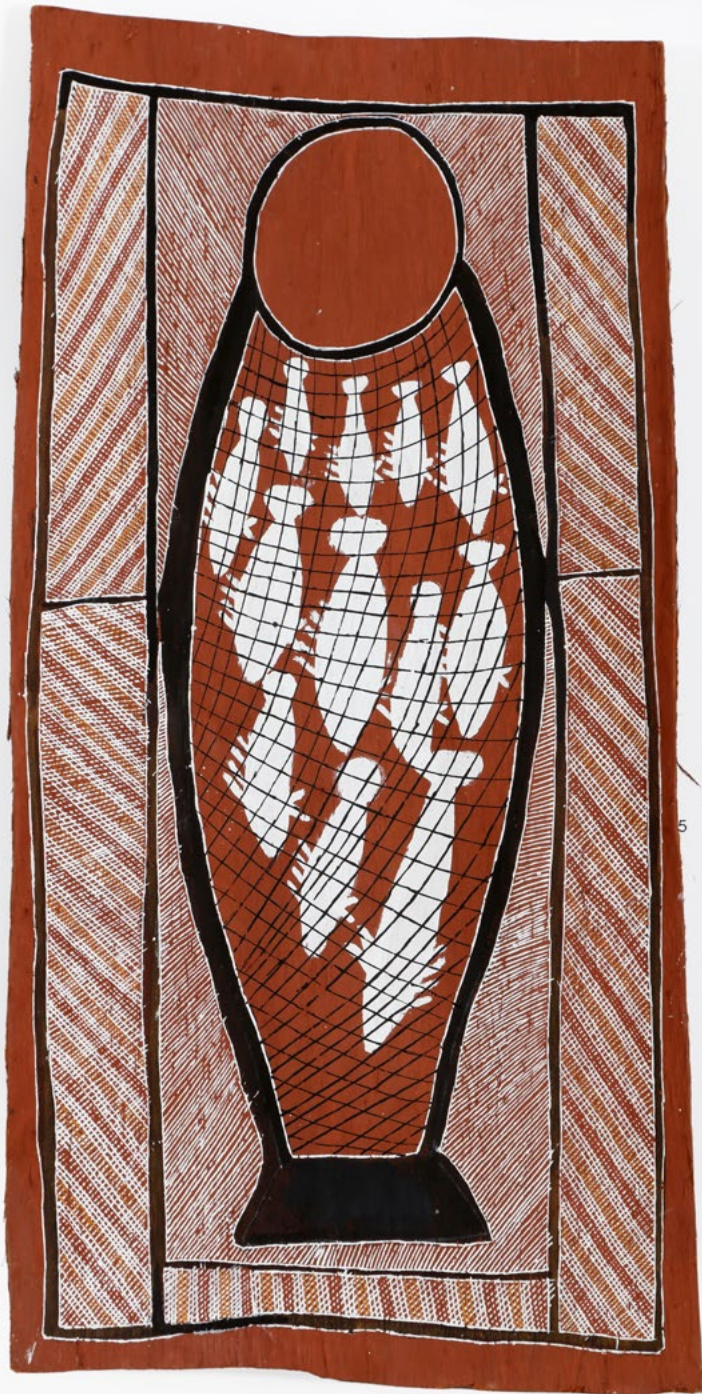
SANDRA RICHARDS Kunkarlewobe (Fishtrap Fence) 2023 Stringybark with ochre and PVA fixative 110 x 56 cm 423-23