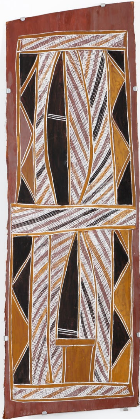
JACK YURRULBBIRRI NAWILIL Kulkaninj (Digging Stick) 2022 Stringybark with ochre and PVA fixative 102 x 33 cm 536-22