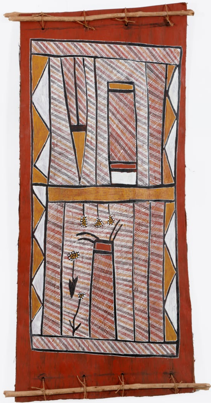
SANDRA RICHARDS Kulkaninj (Digging Stick) 2022 Stringybark with ochre and PVA fixative 129 x 60 cm 579-22