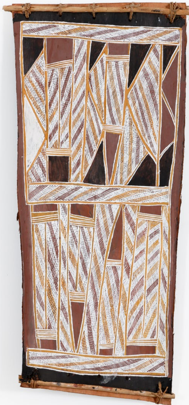
JACK YURRULBBIRRI NAWILIL Kulkaninj (Digging Stick) 2023 Stringybark with ochre and PVA fixative 101 x 45 cm 320-23