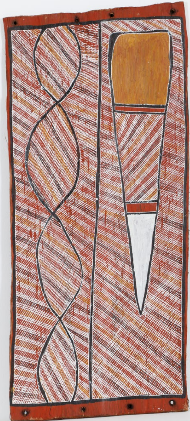
SANDRA RICHARDS Kulkaninj (Digging Stick) 2022 Stringybark with ochre and PVA fixative 75 x 36 cm 582-22