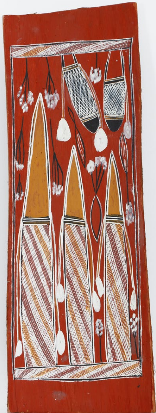
JACK YURRULBBIRRI NAWILIL Kulkaninj (Digging Stick) 2022 Stringybark with ochre and PVA fixative 82 x 27 cm 986-22