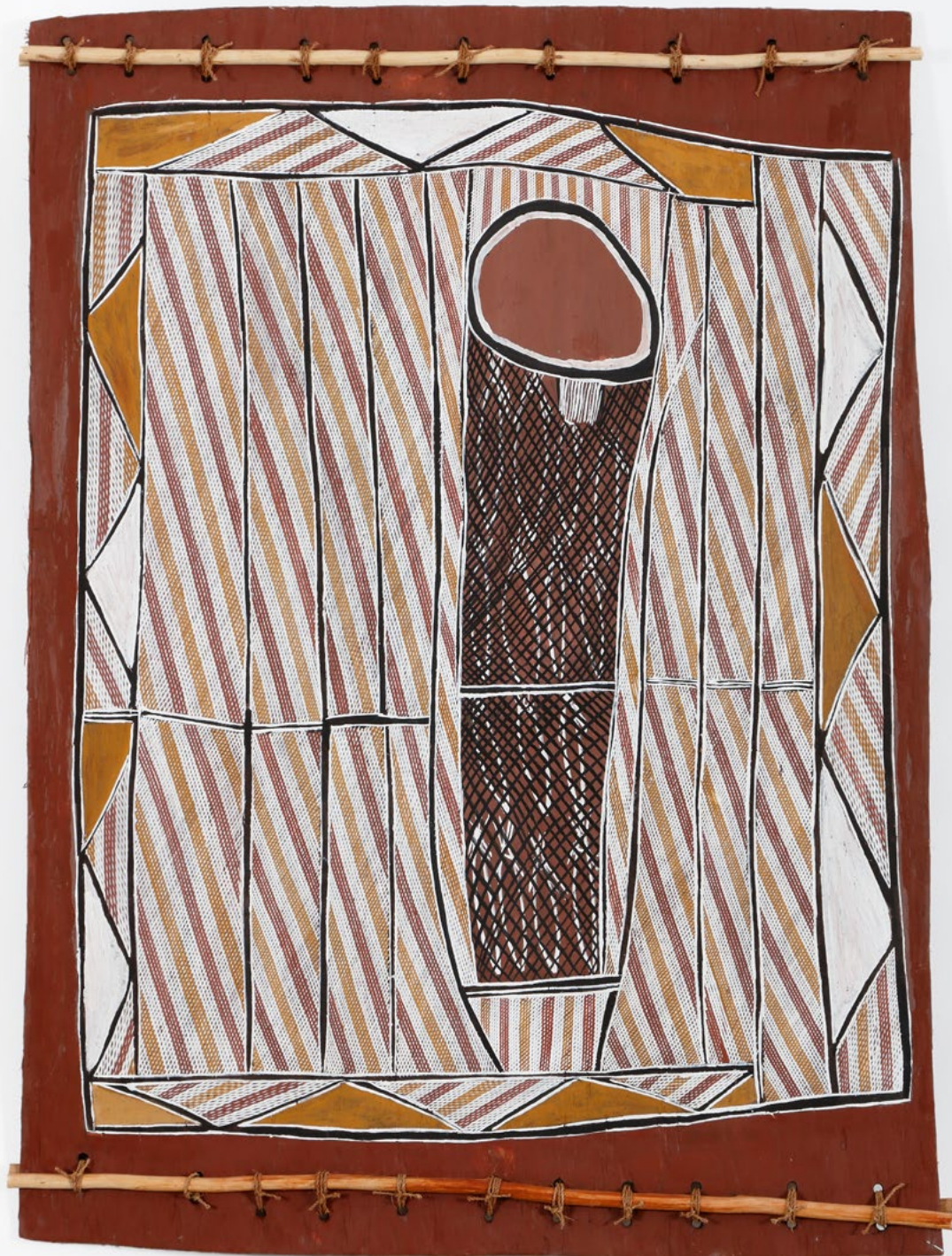
JACK YURRULBBIRRI NAWILIL Kunkarlewobe (Fishtrap Fence) 2023 Stringybark with ochre and PVA fixative 112 x 80 cm