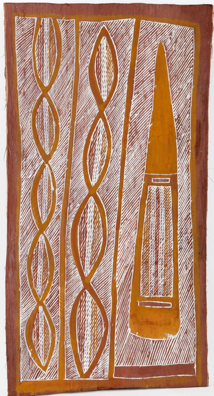
SANDRA RICHARDS Kulkaninj (Digging Stick) 2023 Stringybark with ochre and PVA fixative 60 x 32 cm 281-23