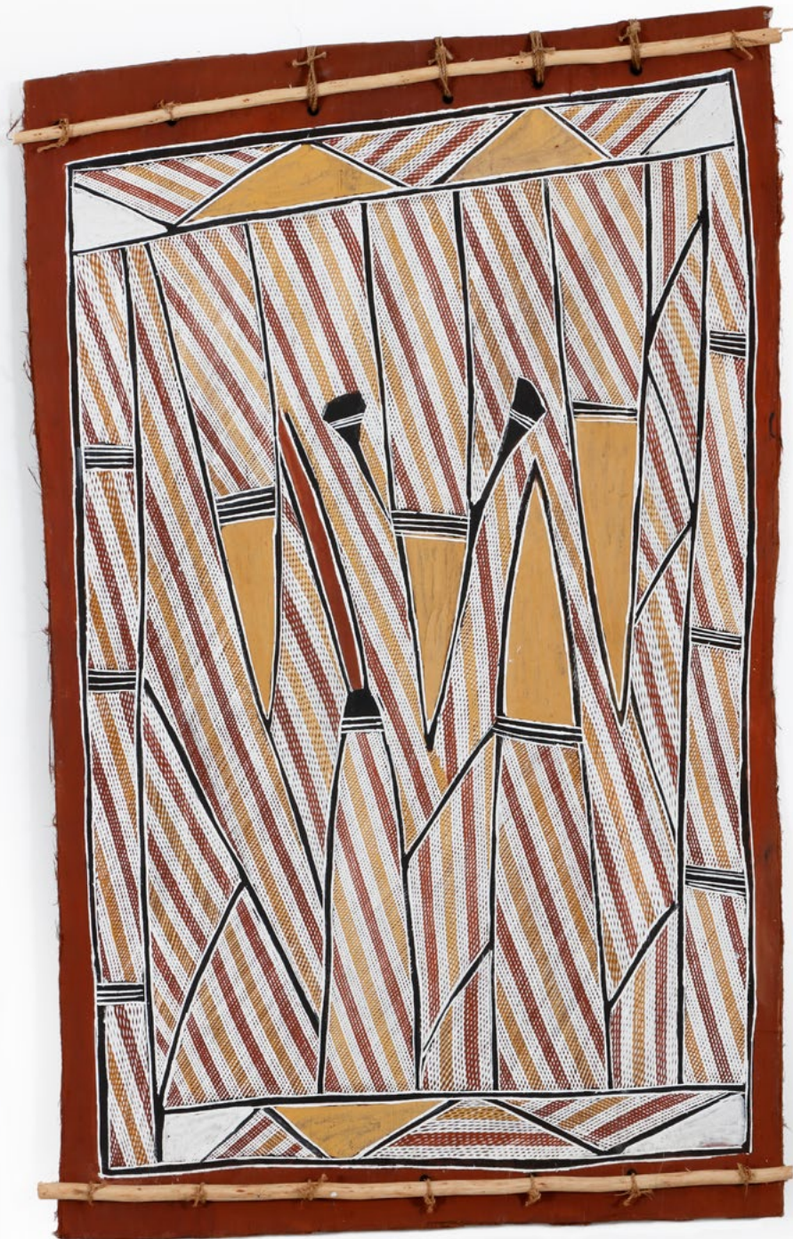
JACK YURRULBBIRRI NAWILIL Kulkaninj (Digging Stick) 2023 Stringybark with ochre and PVA fixative 110 x 69 cm 568-23