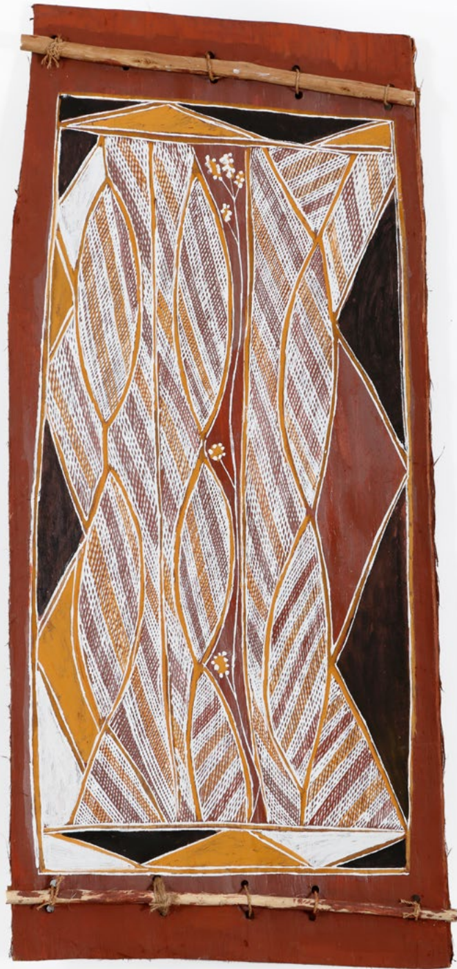
JACK YURRULBBIRRI NAWILIL Mannarlinj (bush potato) 2023 Stringybark with ochre and PVA fixative 95 x 41 cm 322-23